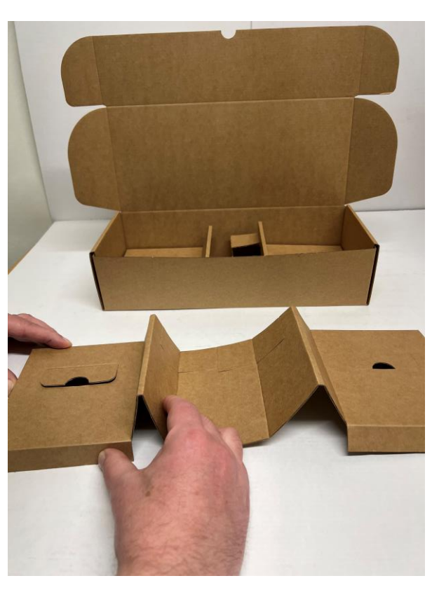
With the recycled (less smooth) side upwards, fold in the side flaps